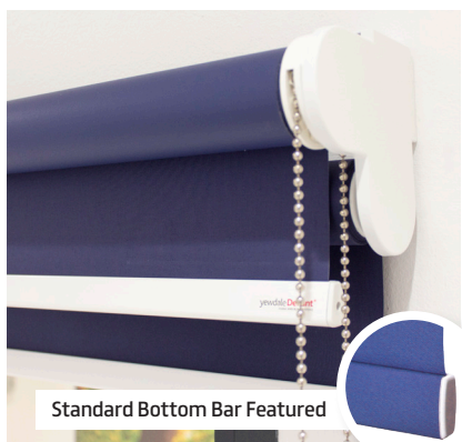
Standard Bottom Bar Featured