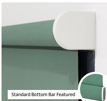
Standard Bottom Bar Featured