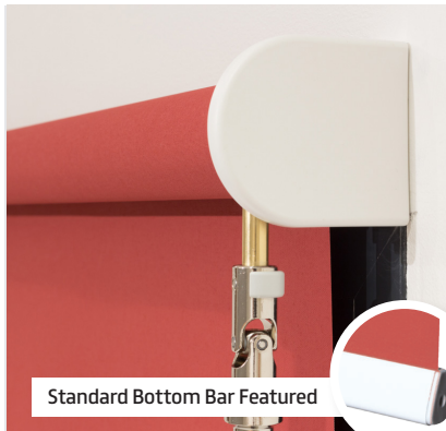
Standard Bottom Bar Featured